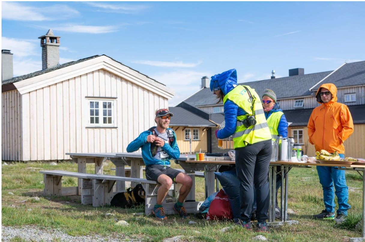
Picture 1 Food station at Krækkja

It is important that everyone enter the cabin at Finse, Krækkja and Kjeldebu as these are checkpoints. It's also important that a clear message is giving if you decide to withdraw from the race.