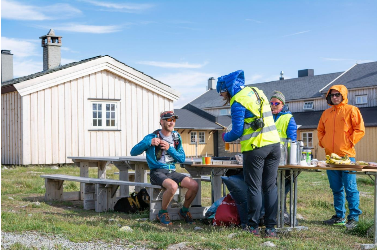
Picture 1 Food station at Krækkja