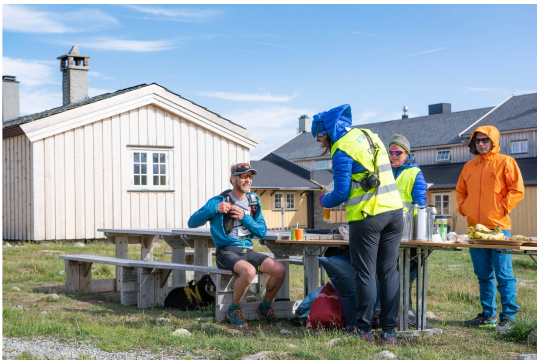
Figure 1 Food station at Krækkja

It is important that everyone enter the cabin at Finse, Krækkja and Kjeldebu as these are checkpoints. It's also important that a clear message is giving if you decide to withdraw from the race.