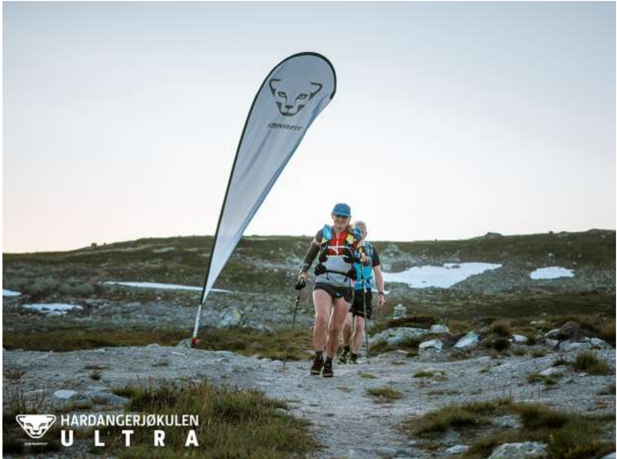
Bilde 1 Fra Dynafit Hardangerjøkulen Ultra 95k