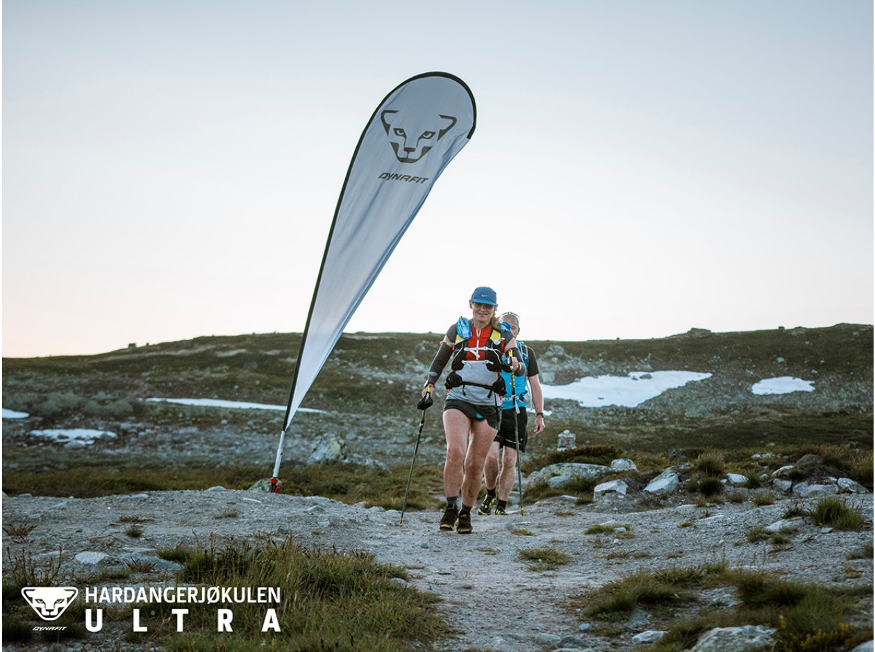
Bilde 1 Fra Dynafit Hardangerjøkulen Ultra 95k