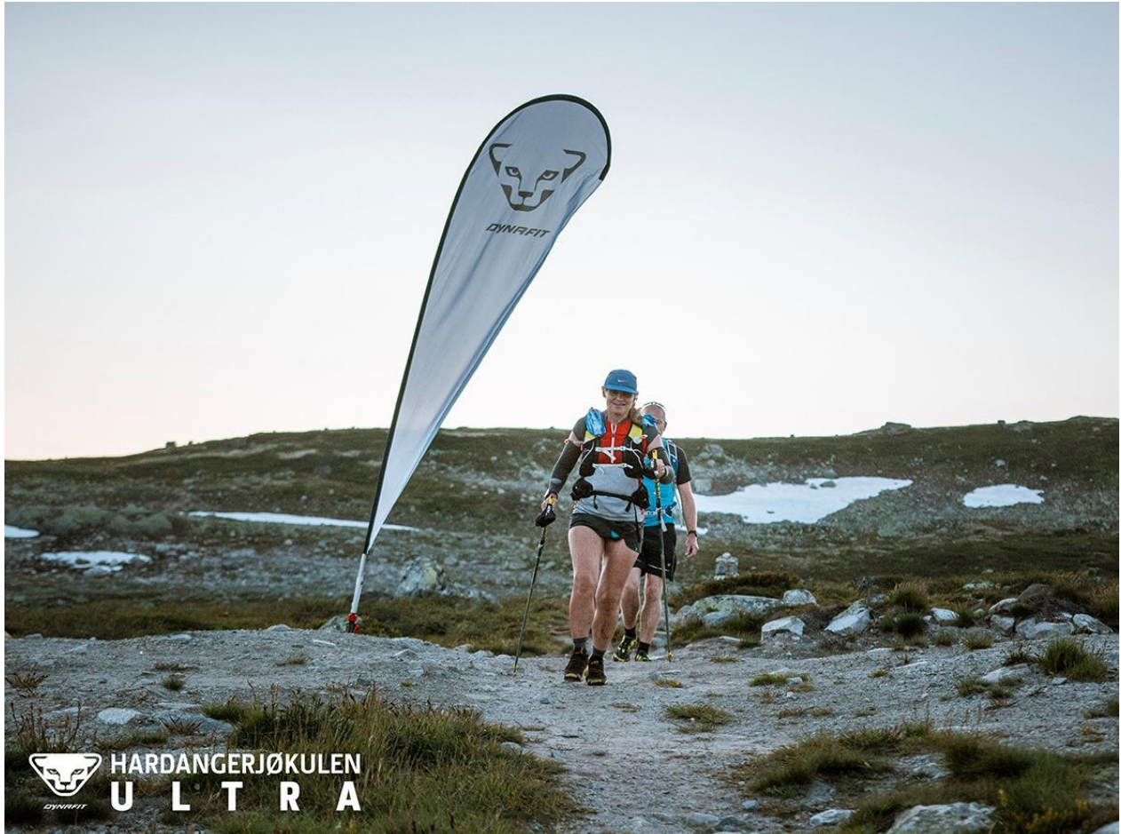
Bilde 1 Fra Dynafit Hardangerjøkulen Ultra 95k